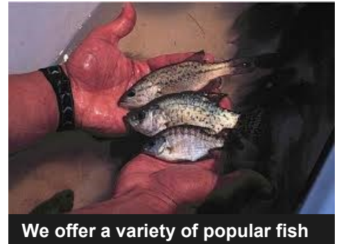
We offer a variety of popular fish

We can create a custom package based on the unique characteristics of your pond. Contact us today.