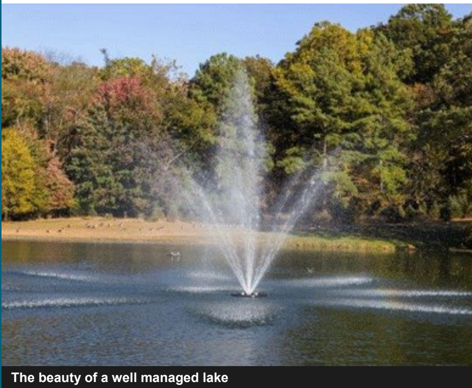
The beauty of a well managed lake