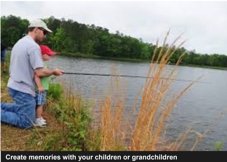
Create memories with your children or grandchildren

Or for a detailed stocking guide visit our stocking guidelines page at: www.missourifishfarms.com/stocking